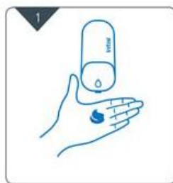
Wet hands and apply soap

Simply, the corona has a fatty sticky outer layer which means it sticks very easily to any surface. Soap has a compound which dissolves the fatty layer and the corona either falls off the surface or is killed. It is important that the soap is rubbed into your hands long enough to create a lot of lather, which should then be rubbed over the whole of your hands for 20 seconds to kill all the coronas' or the rubbing knocks them off. But your hands have many surfaces and parts to clean individually, and the lather needs to cover all of them to capture the germs within—palms, wrinkles, fingernails, between fingers, under rings, band aids, or splints you may have on an injured finger. If you are doing it right, 20 seconds allows for enough time to be thorough, and for soap molecules to do their job on the entire hand.