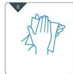
Dry hands thoroughly and sanitise

The use of sanitiser will only work if it contains 70% alcohol. We touch our face with our hands between every 2 and 5 minutes. The following link is very interesting.