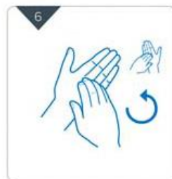
Rotational rubbing in both directions by placing fingertips of each hand in opposing palm