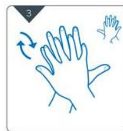
Fingers interlaced, rub hands together, then right palm to back of left hand and vice versa