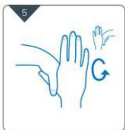
Clasp each hand around opposing thumb and rub in rotational manner