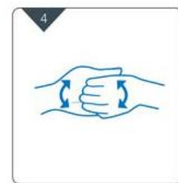
Cusp back of fingers into opposing palm and rub side to side