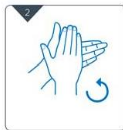
Rub hands, palm to palm